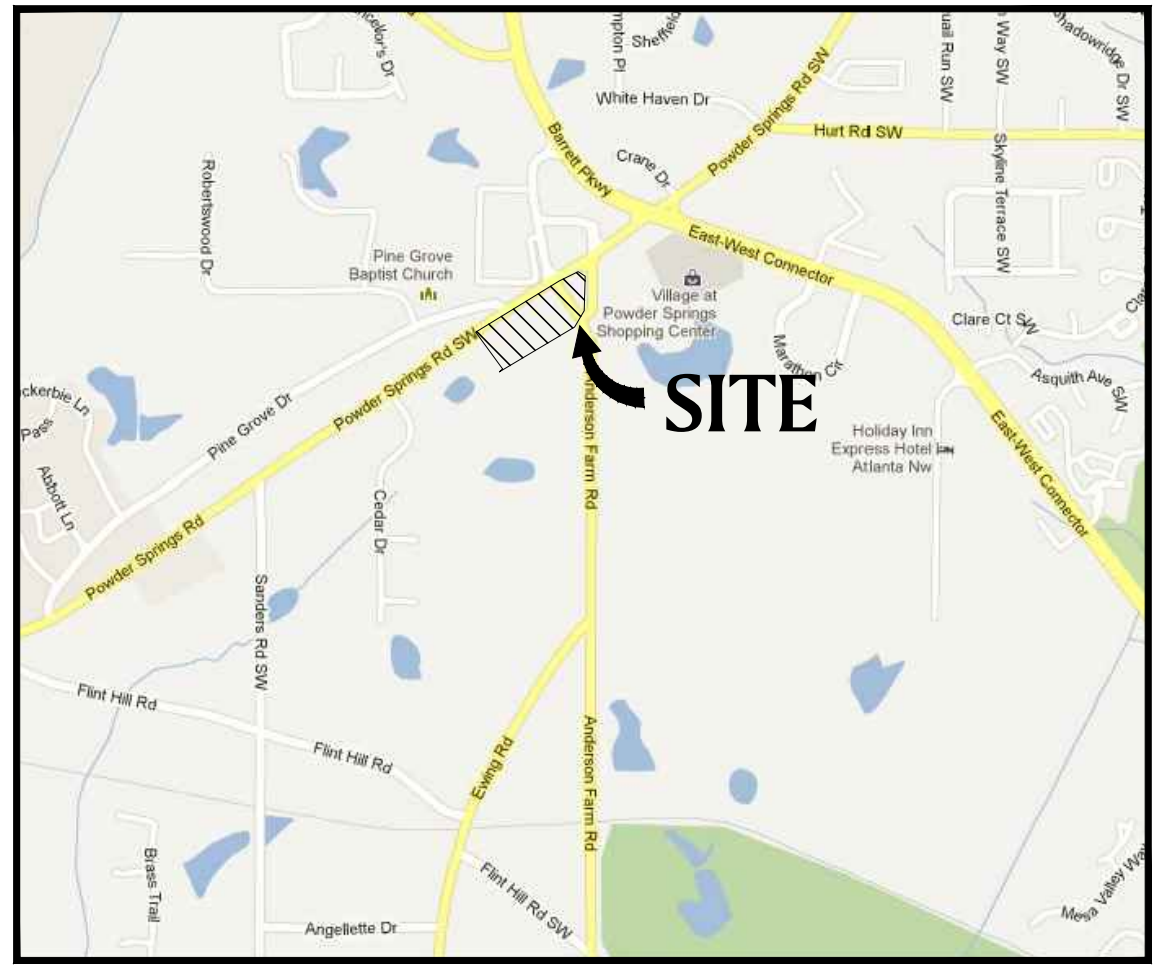
VICINITY MAP COBB COUNTY, GA SCALE: NTS

N/E COLONIAL PIPELINE COMPANY D.B. 14492, PG. 4154